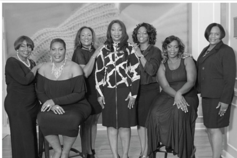
2017-2018 BEAUTIFUL BOLD BOSSES: BEHIND THE MOVEMENT

CASE is a social welfare organization comprised of people from all walks of life that share the common interest of social justice, neighborly love, and community responsibility to its citizens. We endeavor to increase community awareness, institutional accountability, and provoke effective government response to issues affecting vulnerable citizens. Please go to www.caseonthemove.org to learn more about our organization, become a member, and make a generous donation to our cause.