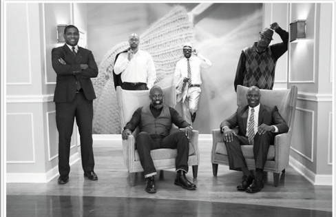
2017-2018 MEN OF BLACK EXCELLENCE